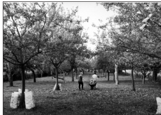
Picking up cider apples at Gregg's Pit, Much Marcle.