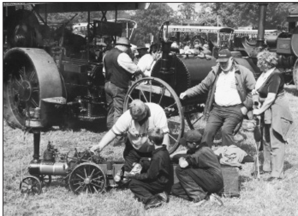
Miniature traction engine at Bromyard Gala.