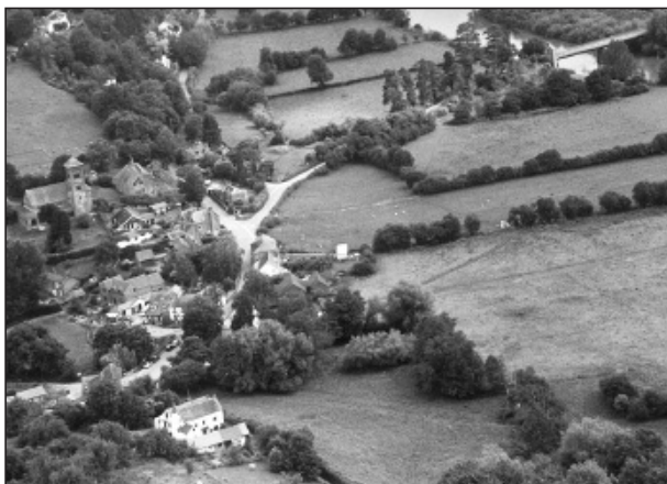
Along the Wye: Hoarwithy