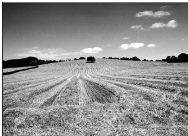
After the harvest.